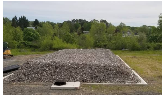
The Biofilter odour control system at the Wastewater Treatment Plant came online in November 2018 and is operating well.